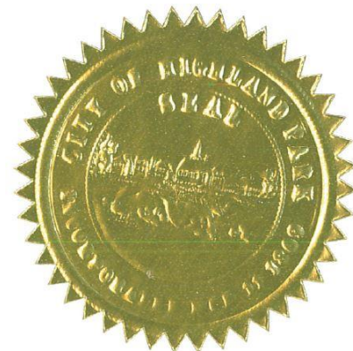
_____ City Seal