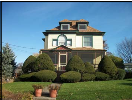
VoH LANDMARK / HISTORIC DISTRICT Designation

McHenry County Historical Society Landmark Designation - Dec., 2001