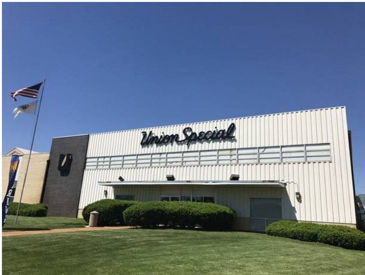
Owners of Union Special Corp. are gearing up to open a microbrewery/taproom in the original Borden Dairy section of the manufacturing facility, west of Route 47 and north of downtown Huntley.