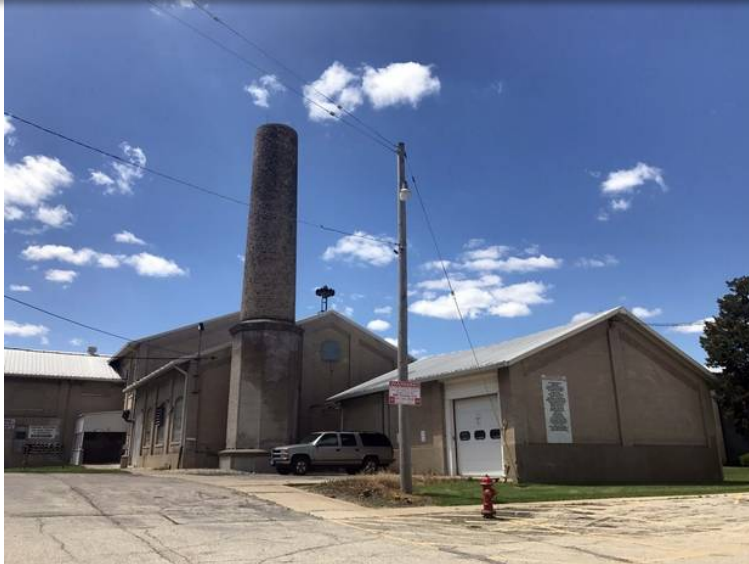
A portion of Union Special's manufacturing facility in Huntley soon will be home to the village's first microbrewery/taproom.