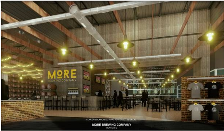
Villa Park-based More Brewing plans to begin renovations this spring on its second production facility, including a brewery and brewpub restaurant at 13980 Automall Drive in Huntley. ( Courtesy of Harris Architects )