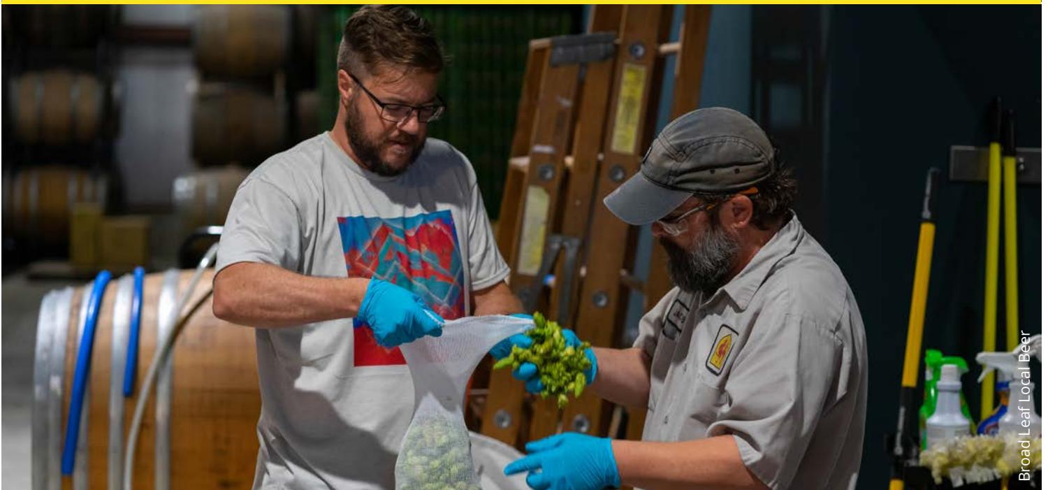
Broad Leaf Local Beer