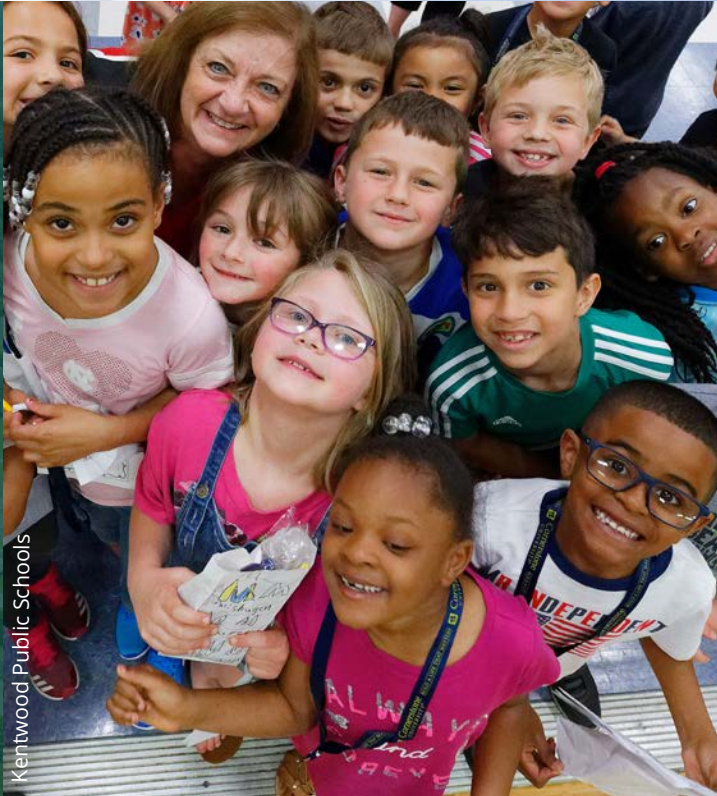
Kentwood Public Schools