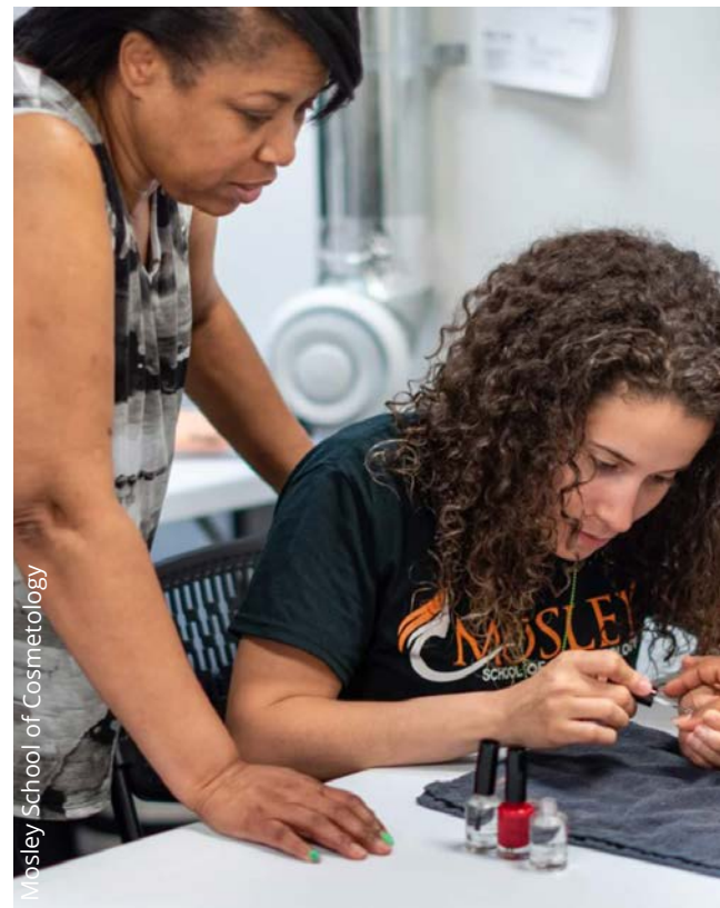
Mosley School of Cosmetology