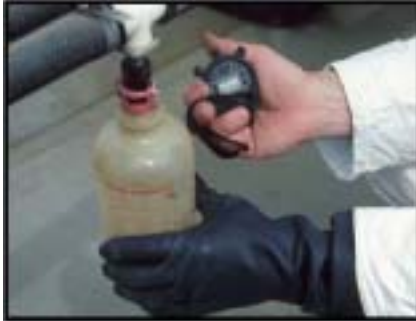
Use a stopwatch to calibrate your sprayer prior to applying fertilizers and pesticides.

• Use commercial fertilizers with low amounts of nitrate and phosphate.