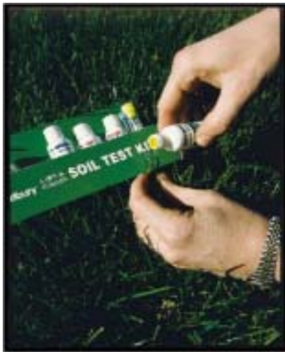
Test your soils for nutrient needs.

• Keep fertilizer away from sidewalks and driveways where it may be washed into surface water or storm sewers.