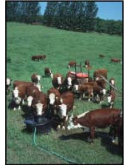
Livestock can be given water using an off-stream portable watering system in the pasture.