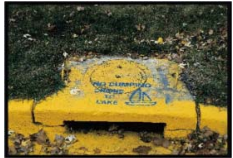
Many communities have begun to label storm sewers to discourage people from dumping any toxic materials.

Increased volumes of stormwater runoff cause excessive streambank/shoreline erosion, which widens the waterway, and ultimately alters how water moves through the entire system. This is of great concern to all riparian landowners who stand to lose valuable property as their streambanks or shorelines wash away.