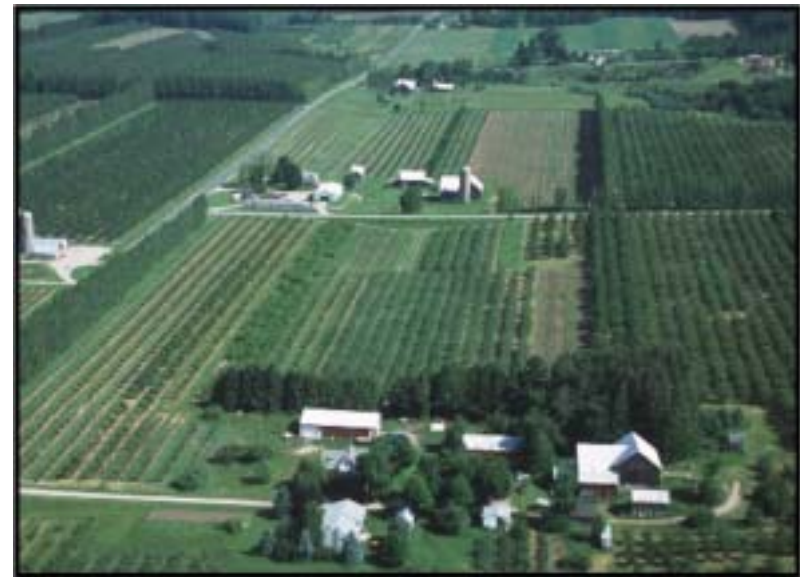
Small farms with orchards, crops, and windbreaks.