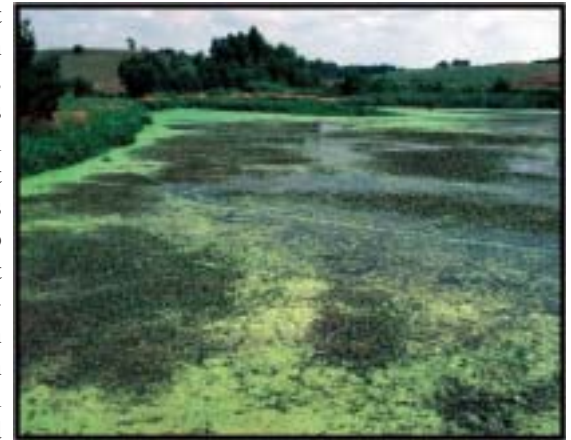
Algae overtakes this lake.

Nutrients and pesticides that are not applied correctly can be toxic to humans, wildlife, livestock, and aquatic plants and animals. The potential health affects can be short term or long term. Excess phosphate in waterways also contributes to the enrichment of water causing excess algae growth and oxygen depletion, which can result in fish kills, reduced recreational opportunities, and reduced aesthetic values.