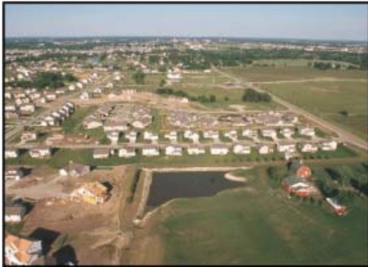
New homes replace farmland.