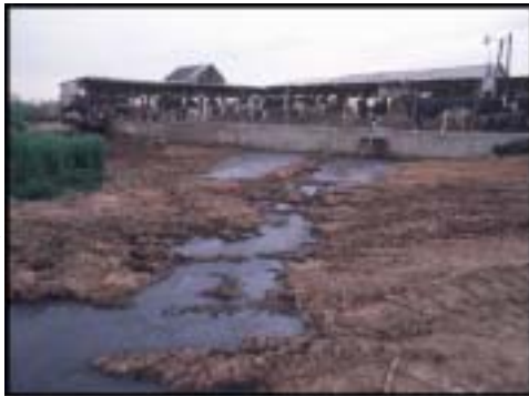
Manure from a livestock yard can run off into a nearby stream and degrade water quality.