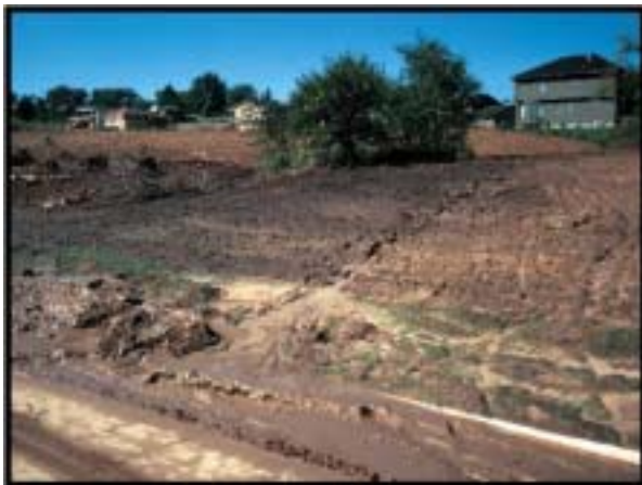
Sediment is seen in the street because measures were not taken to protect the soil from erosion during development.

Chemicals and hydrocarbons from materials commonly used during construction activities can also be picked up through surface water runoff and be washed into waterways.