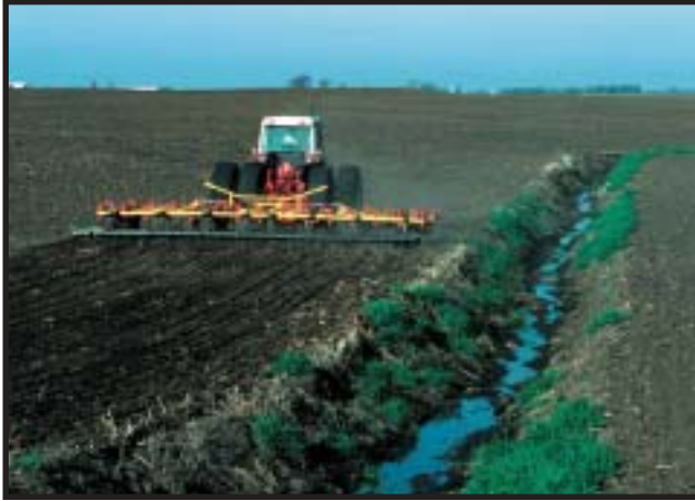
Streams with no conservation buffers are at high risk for thermal pollution.