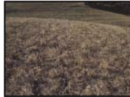
Crop residue increases water absorption and reduces the volume of surface water.

For further information or questions, please contact your local USDA Natural Resources Conservation Service or Conservation District office (see page 25).