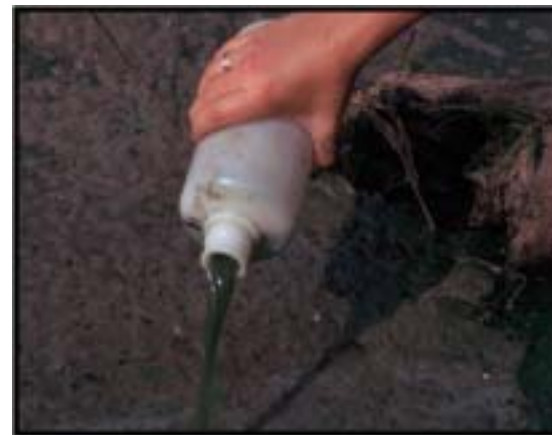
Water with excessive nutrients.

Nutrients and pesticides can be washed into lakes and streams during storms or they can leach into groundwater harming drinking water supplies.