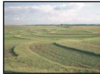
Grassed contour buffer strips cover an entire field.