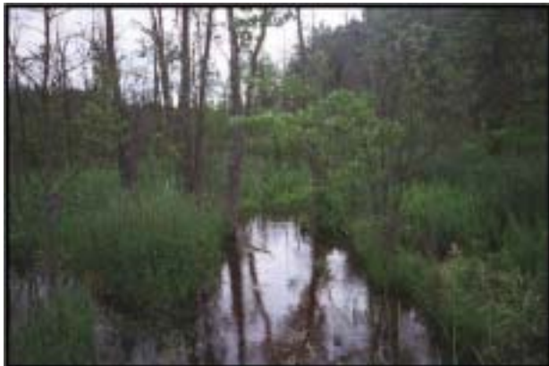
Wetlands are natural systems that filter stormwater and release it slowly into lakes, streams, and rivers.

Remember... The width of the buffer strip depends on the size of the water body, the type of buffer strip you plant, and the amount of runoff generated from your property. Buffer strips can range from 20 to 100 feet wide. Contact your local Department of Environmental Quality or USDA Natural Resources Conservation Service office for more information about the size and type of buffer strip you should plant (see pages 24 and 25).