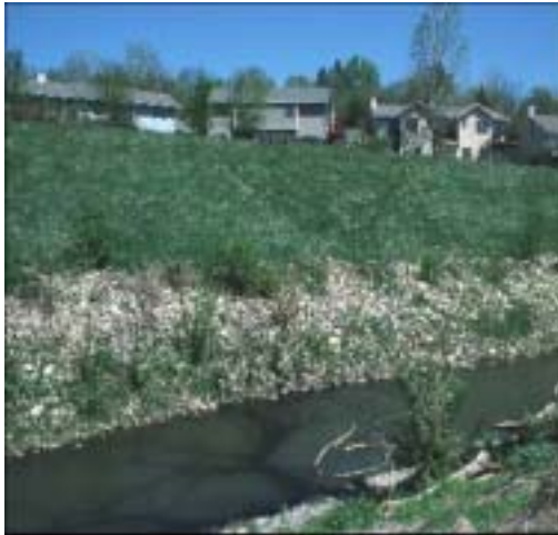
This streambank is stabilized with vegetation and riprap to protect the homes bordering this waterway.