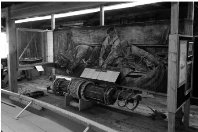
Photo of the mural “Hauling in the Net” by artist Zoltan Sepeshy, shown in its Beaver Island Historical Museum location in 2019 prior to the mural's recent restoration. The mural was originally installed in the Lincoln Park Post Office from 1940 until 1967.

Members of the Historical Society will also be invited to attend the fall dedication – date TBA – of the Depression-era Post Office Mural replica. The original mural, “Hauling in the Net” by Cranbrook artist Zoltan Sepeshy, measuring some 5 feet by 14 feet, was installed here in the post office building (now the museum) in 1940. The mural was later moved, in 1967, to the care of the Beaver Island Historical Museum in northern Lake Michigan. After recently concluding an extensive six-month conservation process, the mural will be re-dedicated on Beaver Island at the same time the full-size replica will be installed and dedicated here in Lincoln Park.