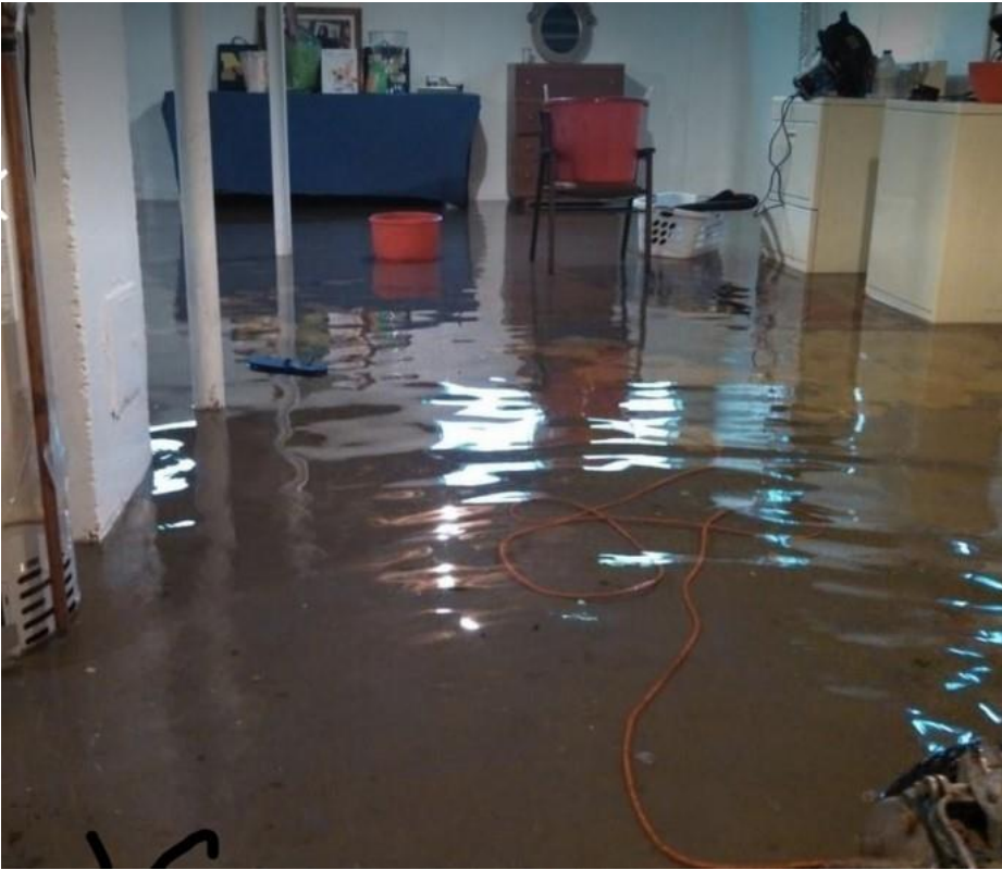
Flooded basement, dangerous electrical hazards

Wayne County was allocated $5,593,057 by the State of Michigan to fund this program. Grants will be distributed to impacted residents to cover damages and costs. To be eligible, the applicant's property must be located in Wayne County (outside of Detroit) and the property must be their primary residence. The damage must have occurred due to the June 25-26 weather events, and applicants must have applied for FEMA assistance. Detroit residents can apply for assistance through a parallel program operated by the City of Detroit.