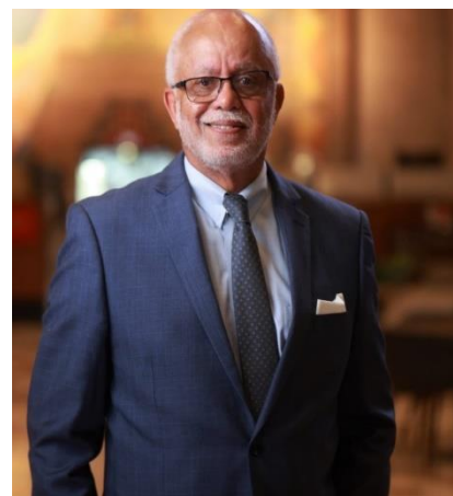
Wayne County Executive Warren C. Evans

Among the top 100 districts included were Grosse Pointe Public Schools (ranked 12), Plymouth Canton Community Schools (ranked 37), Woodhaven-Brownstown Schools (ranked 51), Livonia Public Schools (ranked 80), and Trenton Public Schools (ranked 89).