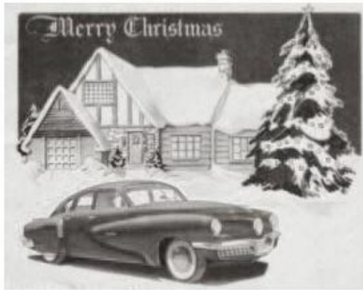
Tucker Corp. Christmas card 1947

Commemorating the 70 th anniversary * of the debut of the ground-breaking Tucker automobile