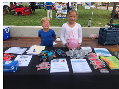
UNITED WAY KICK OFF