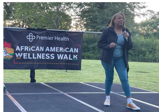
AFRICAN AMERICAN WELLNESS WALK