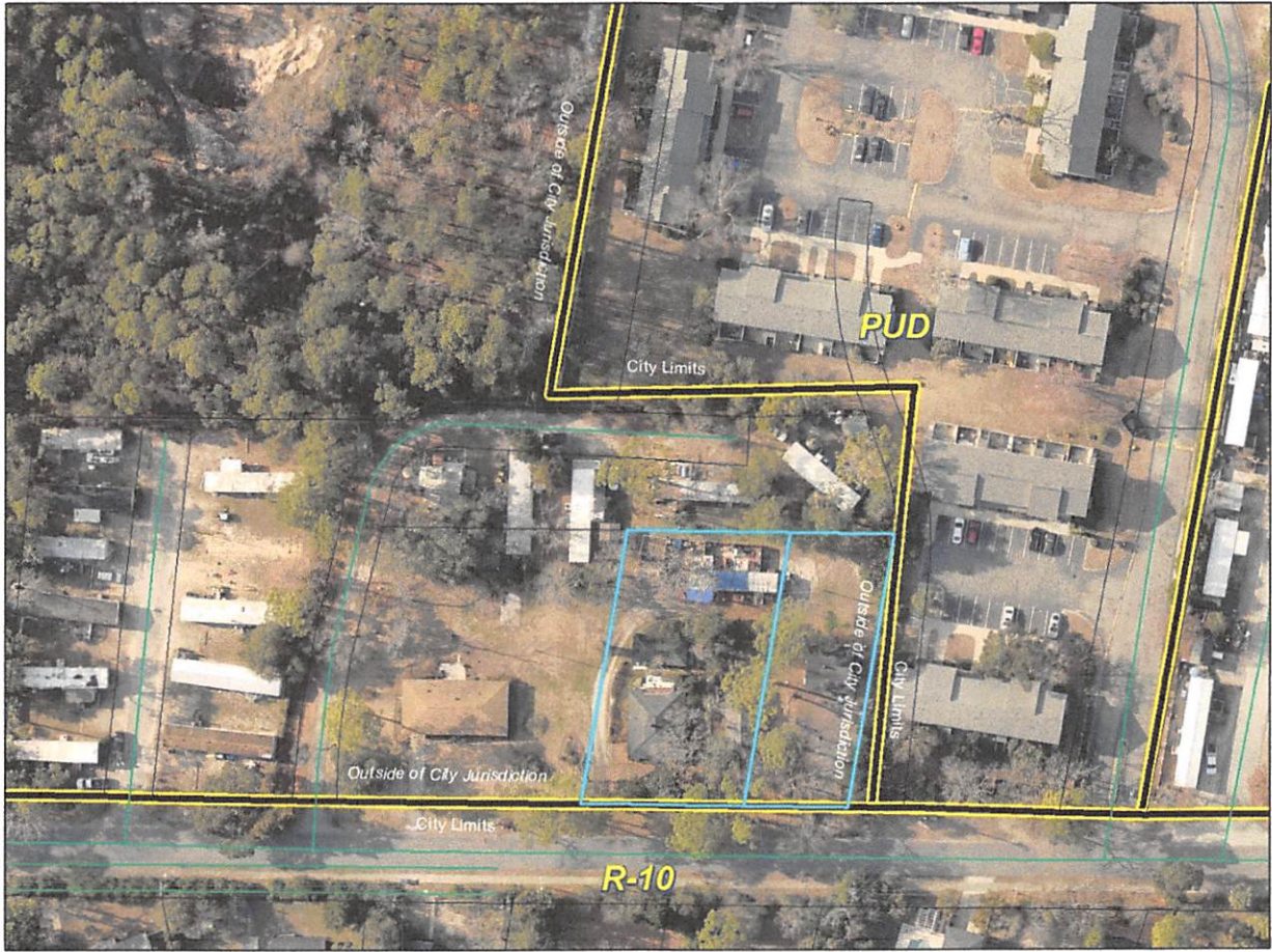
Proposed Annexation - 4105 & 4107 Little River Rd