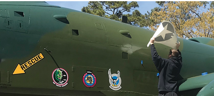
Myrtle Beach's "air force" just received a new coat of paint. Three planes on permanent display at Warbird Park on Farrow Parkway recently were repainted to US Air Force specifications. The planes are an A-10 Warthog, an A-7D Corsair and an F-100 Super Sabre.