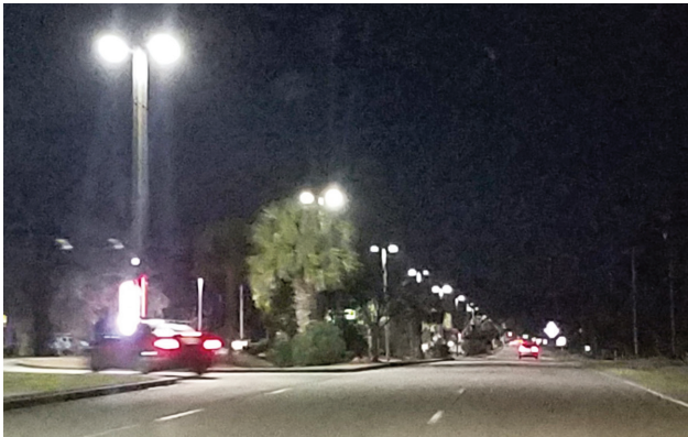
South Kings Highway in Myrtle Beach is brighter at night thanks to new LED street lights installed by Santee Cooper.

In addition to the camera system, the Myrtle Beach Police Department has automated license plate readers at each of the entrances and exits to the city. During calendar year 2018, these read and processed 23.5 million license plates, returning alerts on more than 70,000 for violations ranging from an expired tag to vehicles wanted in connection with serious crimes. Better lighting also improves public safety, and with that in mind, the city has worked with Santee Cooper to upgrade street lights, especially in high-traffic areas. As shown below, Kings Highway is much brighter, now that LED lights have been installed. Ocean Boulevard and other streets also have received the LED upgrades. LEDs are more energy efficient, too.