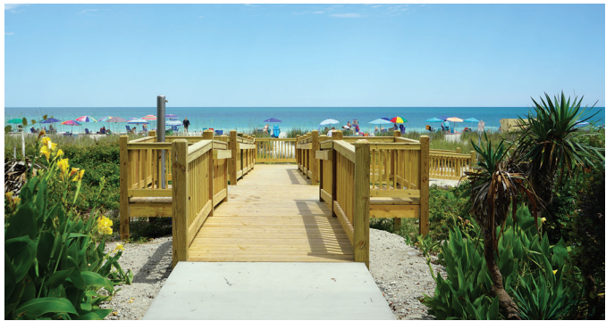
This new dune crossover at 24th Avenue North is handicapped accessible, with an ADA compliant ramp. Myrtle Beach replaces about half a dozen crossovers each year. Work is underway on the next one to be rebuilt, at 73rd Avenue North.