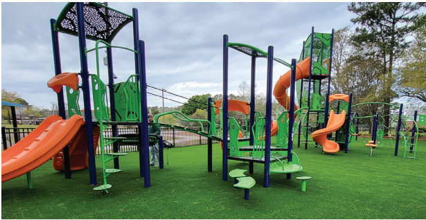
Futrell Park has a new playground and splash pad for kids, thanks to a community conversation on re-imagining the space. Residents came to City Council in March to thank Council and unveil the plans for the next phase: a walking and fitness trail around the pond, with funding from Habitat for Humanity.

Park improvements are near the top of the list this year, and Myrtle Beach's Futrell Park is no exception! New amenities include a splash pad for kids to enjoy during hot weather, along with a completely new playground. Futrell Park is adjacent to Fire Station No. 1 on Mr. Joe White Avenue. It's centrally located and is part of the Booker T. Washington neighborhood. The playground and splash pad are scheduled to open in April. The larger playground has all-new equipment, plus a high-tech artificial surface that's cooler than traditional playgrounds. The new splash pad will provide water activities for youngsters during warm weather.