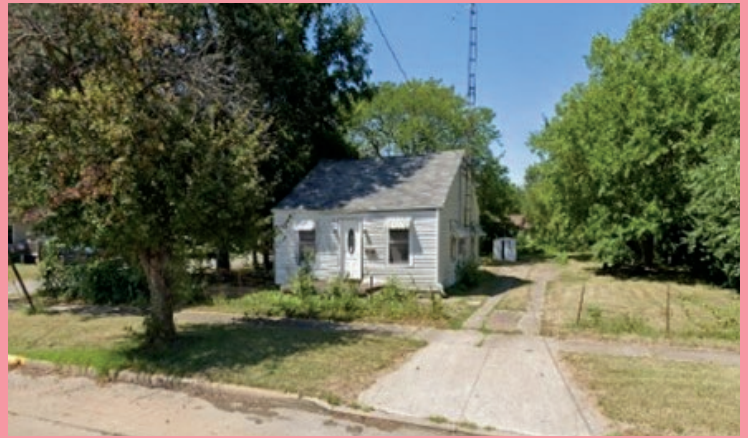
▲ 1817 Pierce Street Demo