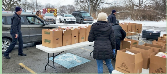
▲ Father's Heart Church Food Pantry Programs