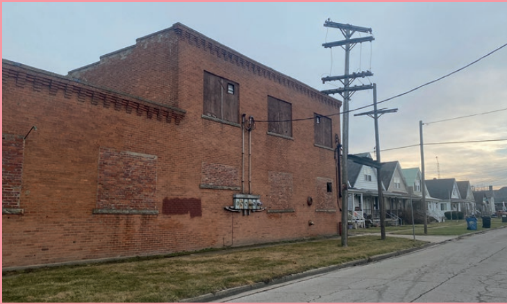
▲ 1228 Osborne Street Demo