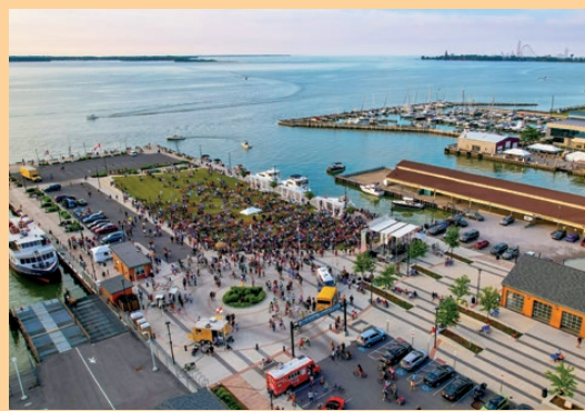
▲ Party at the Pier