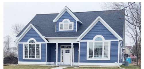
416 E. Market Street new construction