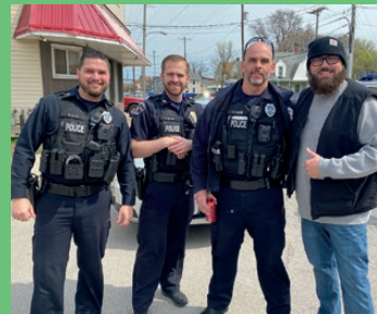
▲ Easter Basket Drive Thru