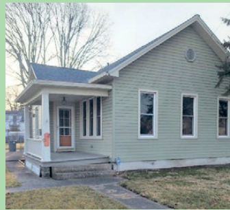
1120 Sycamore Lane before and after