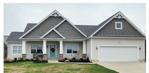
412 Bay Breeze tax abatement