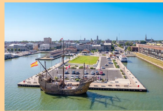
▲ Festival of Sail