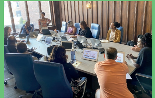
South Side Neighborhood Planning