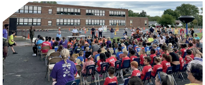
Safety Town Graduation ▲