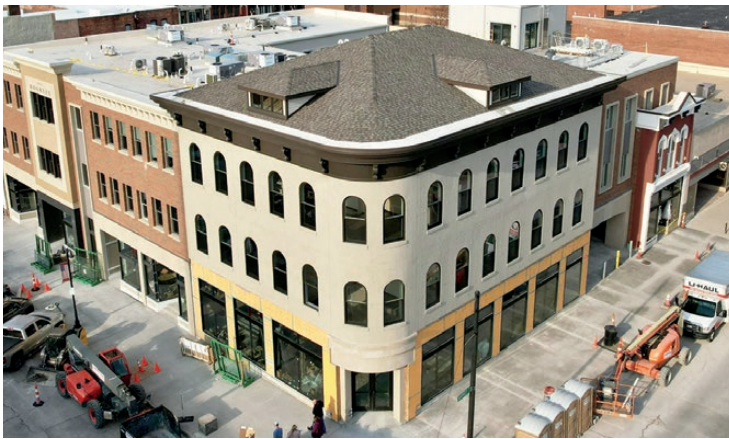
Hogrefe Building, day and night ▼