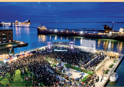
▲ Ohio Bike Week