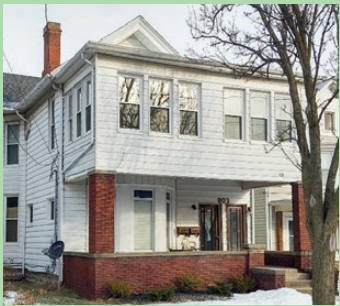
803 W. Jefferson Street before and after