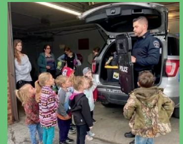
▲ Station Tours