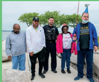
▲ Ability Works Fishing