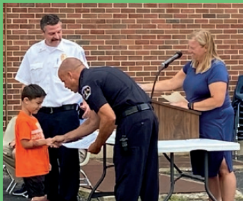
▲ Safety Town