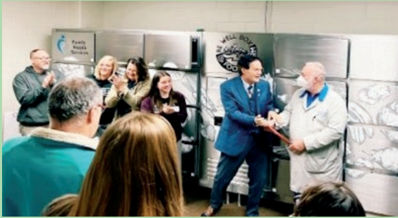
▲ OHgo Food Locker Program