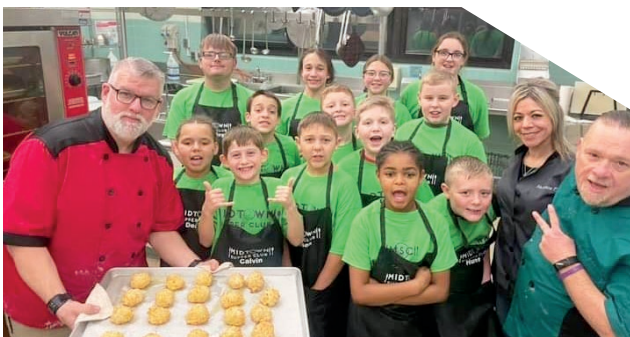
◀ Midtown Supper Club