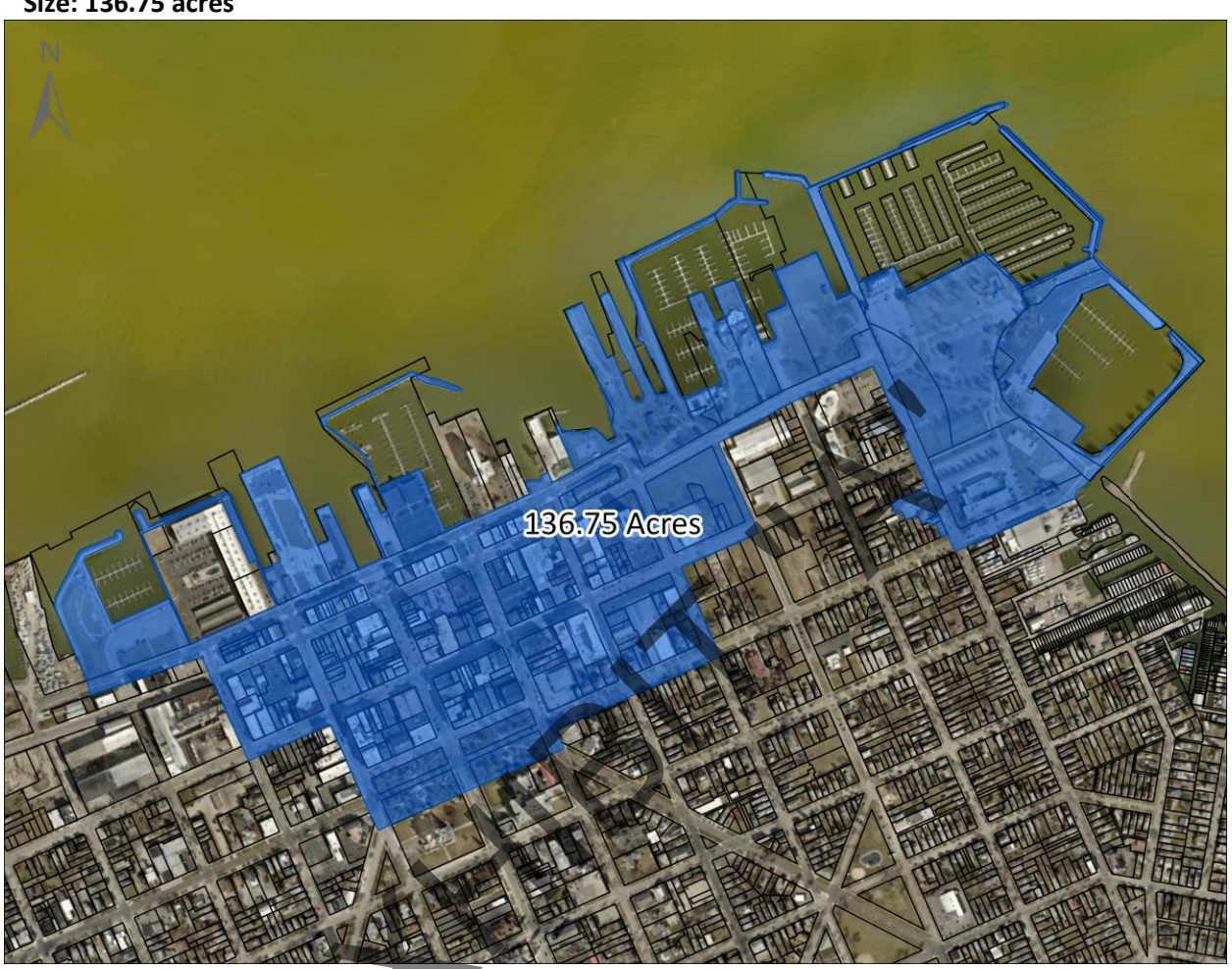
Size: 136.75 acres