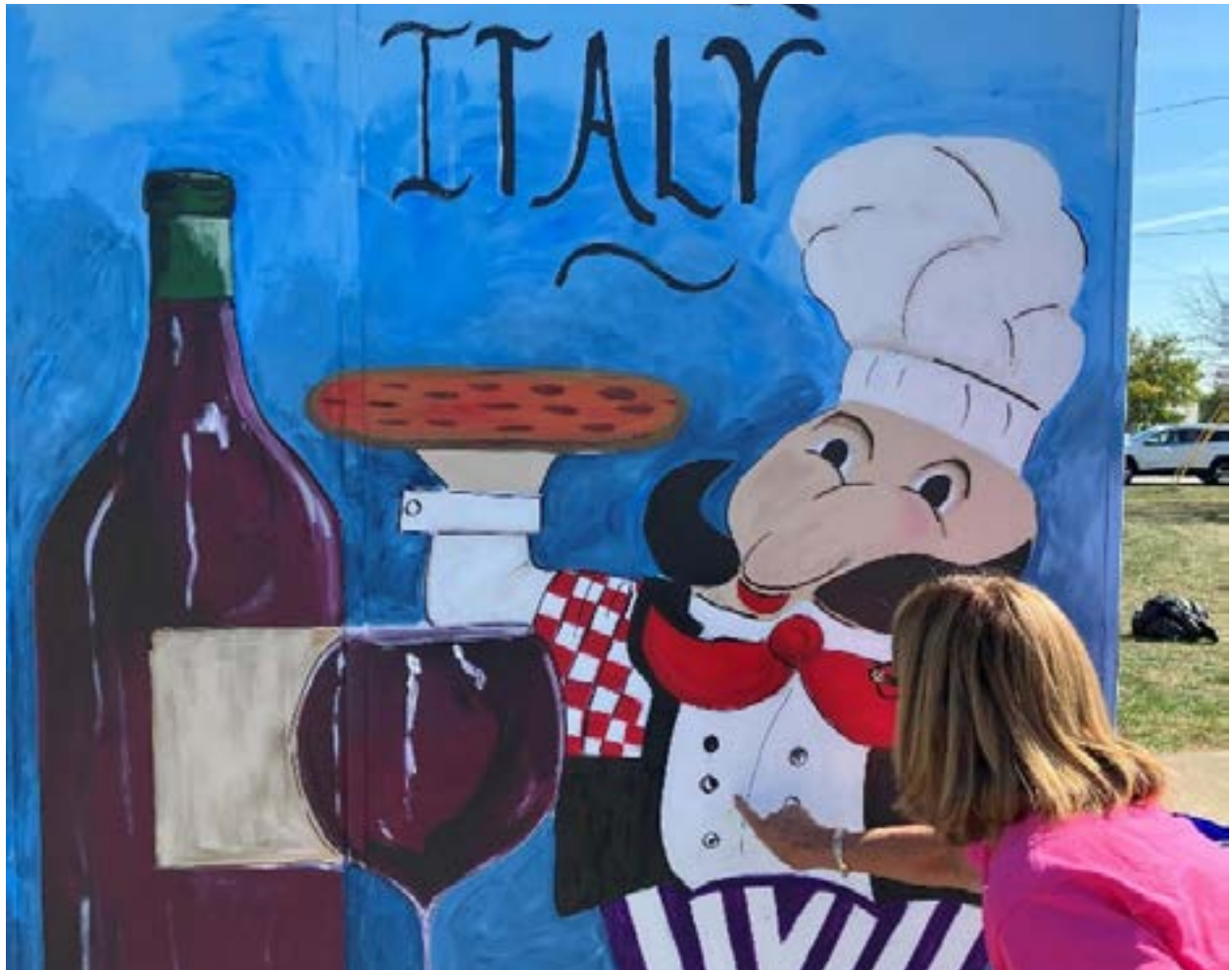
Little Italy - Sandusky's first ArtBox project at Sycamore Line and Cleveland Road Art by Darlene Wood