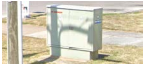
Example of a traffic control utility box.

The ArtBox program was developed by the Public Arts & Culture Commission in 2022 as a high-impact project for immediate implementation. The program seeks to transform traffic control boxes which are ubiquitous along city rights of way. These highly visible structures provide a frequent and unexpected opportunity to feature public art. Program logistics were inspired by PaintBox in Boston, MiniMurals in Houston, and others.