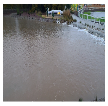
Rancho Vista Development Retention pond flooding