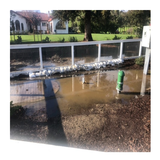
Rancho Vista Sewer Lift Station after sand bagging and drain clearing

The morning of December 27 2021 the Rancho Vista subdivision received heavy storm water runoff from the neighboring undeveloped property this runoff over whelmed a drainage system near the Rancho Vista sewer lift station this flooded the lift station site that could have caused excess storm water intrusion to over whelm the pumps but the wet wells main hatch did a great job holding back the standing water allowing the station to keep functioning correctly. Public Works did some emergency sandbagging and some drain clearing to protect the station from standing water this was extra reassurance to help maintain lift station access also minimizing runoff intrusion.