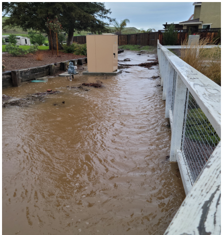
Rancho Vista Sewer Lift Station before clearing the drains and installing sand bags.