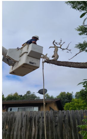
Armando trimming City Tree located at Washington /Lang St

The parks are looking great even with the new restrictions on limiting landscape watering . The city's lead landscaper has done a excellent job maintaining the city's grounds.