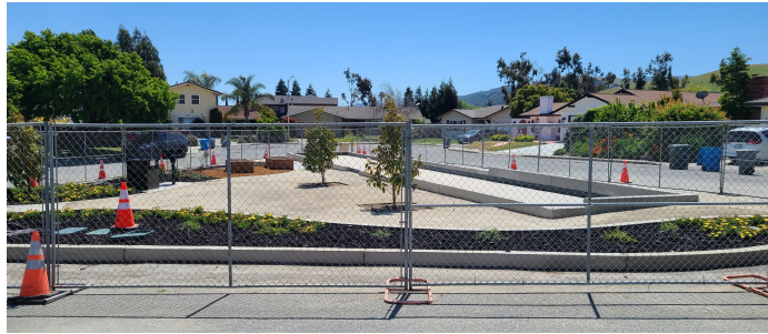
Franklin Park Project completed

This Month in our buildings and grounds department was rather routine no notable Public Works activities to report . There is good news that the Franklin Park Project is completed right on time on . The Verrutti park restroom project is underway as the submittals keep coming in for approval . We should see some construction activity soon . .