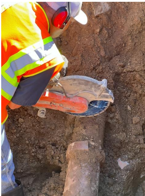
Cutting out old clay sewer main