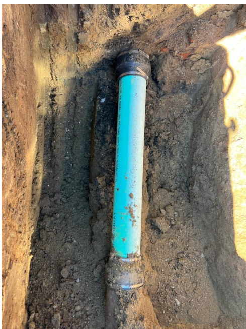
Repaired sewer main