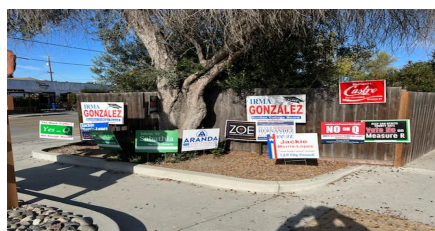
Campaign signs . The signs have been removed

With the current election we have removed many campaign signs from the cities Public right away the removal of signs has been ongoing I figure after the elections this activity will come to a end .