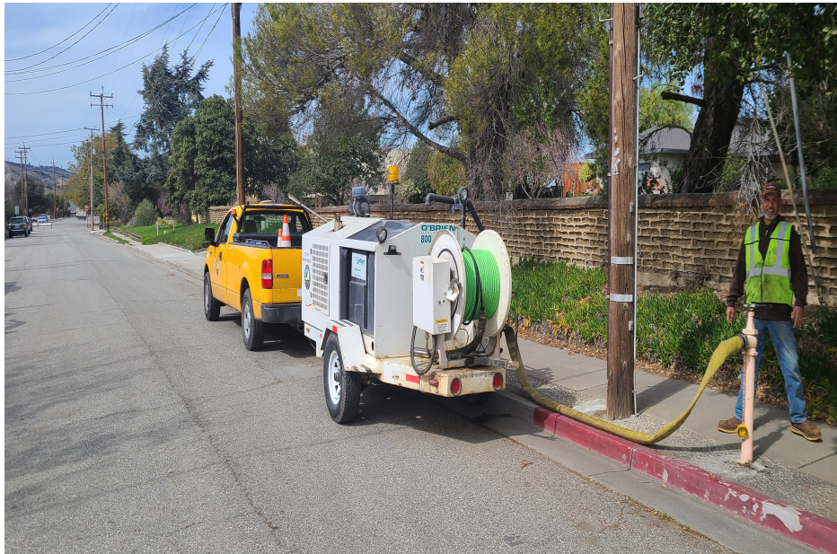
Sewer Jetting Trailer

The Month of October was business as usual. This month required the normal preventative maintenance procedures these include sewer lift station maintenance and hot spot sewer main jetting. The city wide sewer lift stations are serviced 3 times a week and the hot spot jetting is completed by the end of the first week of every new month. The sewer lift stations annual cleaning has also been completed this helps remove debris and grease build up that could lead to pump damage or clogs. Some months have many problems that need to be sorted out and some months are free of any major problems. Public Works is always ready to take on any challenges that might arrive. Our preventative maintenance plan has really helped reduce sewer over flows.