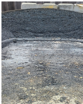
Granite Patch cold patch asphalt product

April was a much dryer month then the crazy month of March that brought with it multiple periods of atmospheric rivers. The wet weather really brings out the development of potholes . Water on our streets and roads finds access in small cracks and low spots and the traffic flow causes hydraulicking which causes weak spots in the pavement to deteriorate and erode causing potholes . Potholes develop more often during the rainy season , this is normal but during years of increased longer periods of rain this tends to contribute to more potholes then average years . The city of San Juan Bautista uses a cold asphalt product for the patching of potholes , this is granite patch product that comes from our nearby Granite Rock quarry . This product really holds up well and its easy to apply during all types of weather compared to a hot patch that needs to be applied at a specific temperature and also requires more prep work for application .