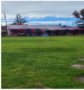
Library and Community Hall with fumigation tents installed

February was another wet month , and due to the wet weather we did not have to irrigate our parks and grounds . This has freed up some time to work on other areas of maintenance . The irrigation system is rather problematic and requires quite a lot of attention during watering times. There will need to be improvements made in the future like automated smart timers that sense the current weather conditions and waters depending on weather conditions , this is especially important during times of drought . Upgrading the irrigation system will likely be expensive and will require sending some (cip) funds set aside and planned for during the next fiscal year .