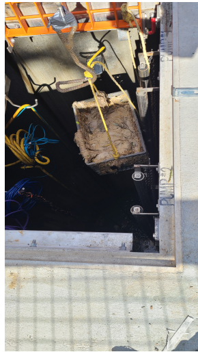
Rancho Vista Development sewer lift station milk crate prior to cleaning .

During the month of February there was not any sewer overflows or problems with our cities collection system and sewer lift stations . During the month Public works performed the normal preventive maintenance duties , and this includes our monthly hot spot sewer jetting and our sewer lift station preventative maintenance duties this includes keeping track of pump hours and recording any performed maintenance this includes washing down the wet well and cleaning off the float controls that can be built up with grease the grease could cause the floats to not perform properly this could cause elevated sewer levels even leading to sewer overflows . The Rancho Vista sewer lift station has had ongoing excessive amounts of grease. The grease is coming from the community , and to control the grease the city has been applying grease control products , and these products are quite expensive . This expense in the future could be funded through the district . The city has asked that the residents of the Rancho Vista development do there due diligence to avoid putting grease down the sewer also any items that belong in the trash , also at the Rancho Vista station we have installed a milk crate to hang under the inflow pipe to catch and intercept baby wipes or materials that can clog up the pumps . The crate is cleaned twice a week or as needed this is a gross and stinky process . The addition of the milk crate has significantly reduced the pumps from clogging up .