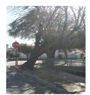
Verutti Park Fallen Trees due to the January Storms

The new Verutti park restrooms needed some adjustments to the doors and some improvements to the plumbing system. This work was performed under warranty. The North facing door was vandalized somebody from the Public bent the door, its unfortunate that certain people feel the need to deface city property. The cities Library and the Community Hall have termites. The termites will need to be abated this will require both buildings to be fumigated. The fumigation will need to be critically scheduled to minimize interruption to use of the facilities