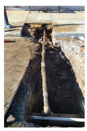
Polk St Water line

Good news with the recent rains this has helped fill up the underground aquifers that are located in the area of our cities wells these recent rains has helped support our towns water usage and production. We still need more rain but 2023 is off to a great start.