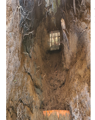
451 San Juan Hollister Rd