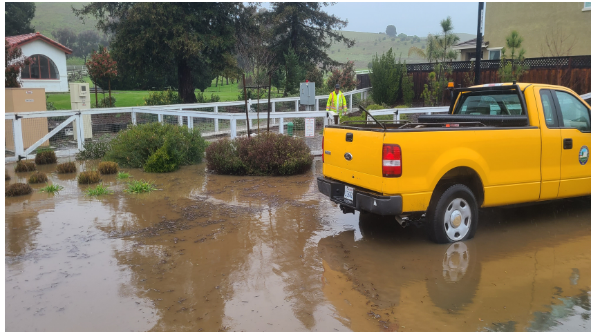
Rancho Vista Development sewer lift station flooded March 10th 2023 .

The March 10th storm did cause concerning flooding in the immediate area of the Rancho Vista sewer lift station. Flood water flowed right through the station , thank goodness the wet well hatch seals really well . The hatch seal prevents storm water intrusion from entering the wet well , excess storm water could overwhelm the pumps and could cause a (SSO) sanitary sewer overflow , none the less we did install some sand bags around the hatch for extra reassurance .