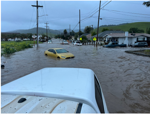
The Alameda St Flooded