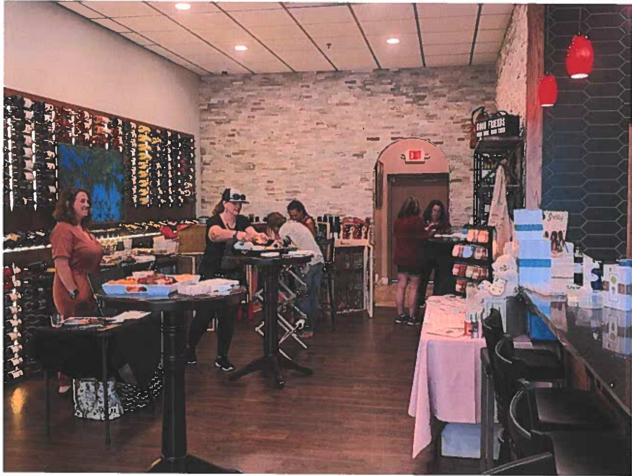
New Lenox location