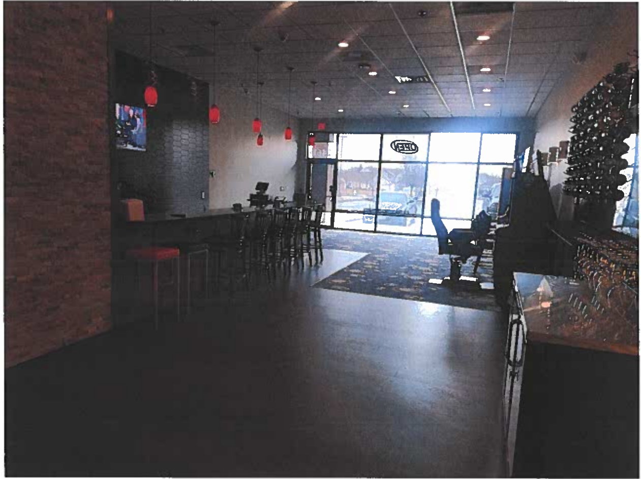
New Lenox location