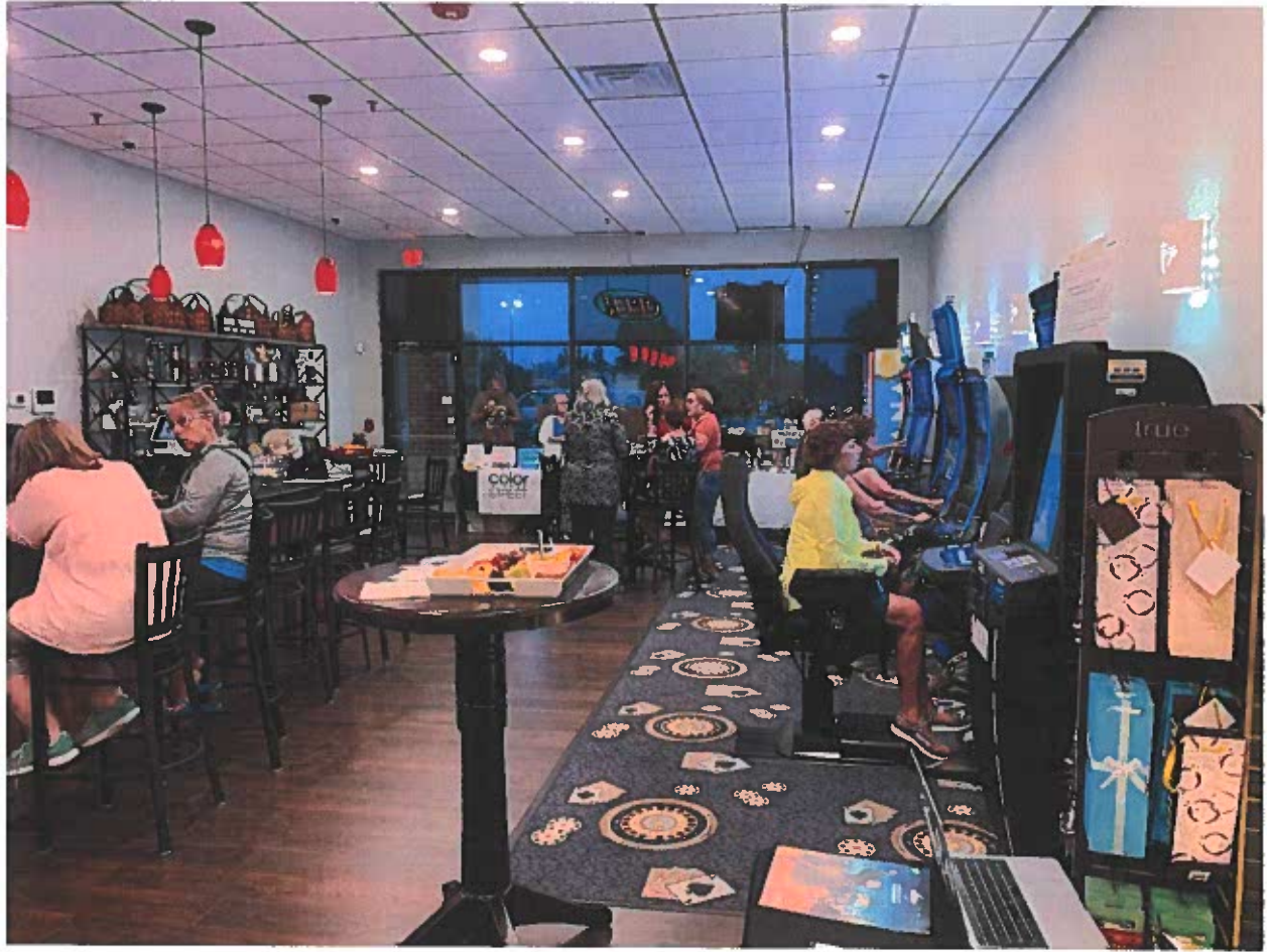
NEAR LENOX LOCATION