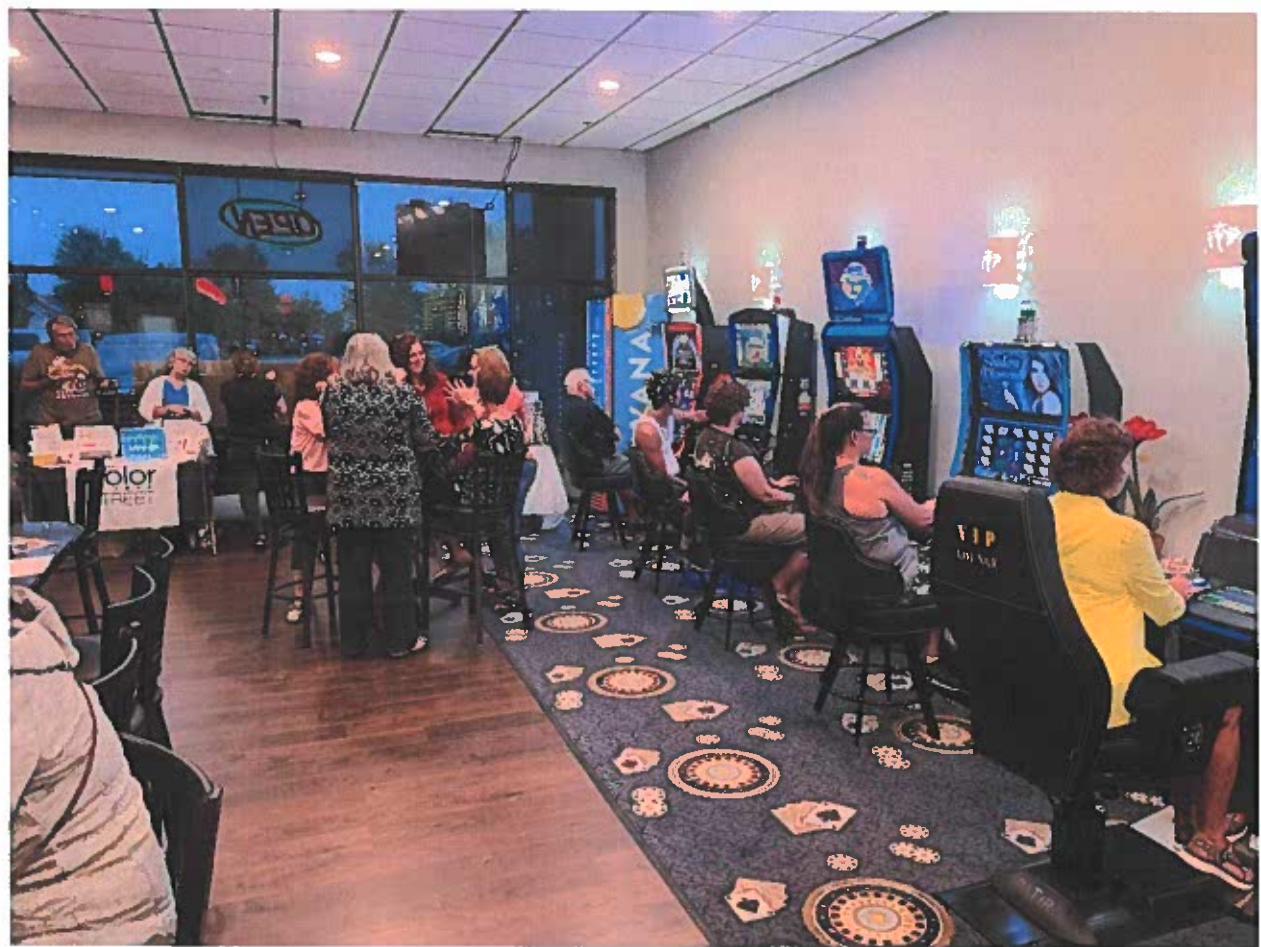
new Lenox location