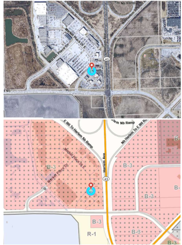
Location map (top) & zoning map (bottom)

The Petitioner is requesting a Special Use Permit to operate a Tobacco Store in the B-3 (General Business and Commercial) zoning district. The Zoning Ordinance defines a Tobacco Store as "a retail establishment that derives 65% or more of its gross revenue from the sale of Tobacco Products and Alternative Nicotine Products, and in which the sale of other products is merely incidental".