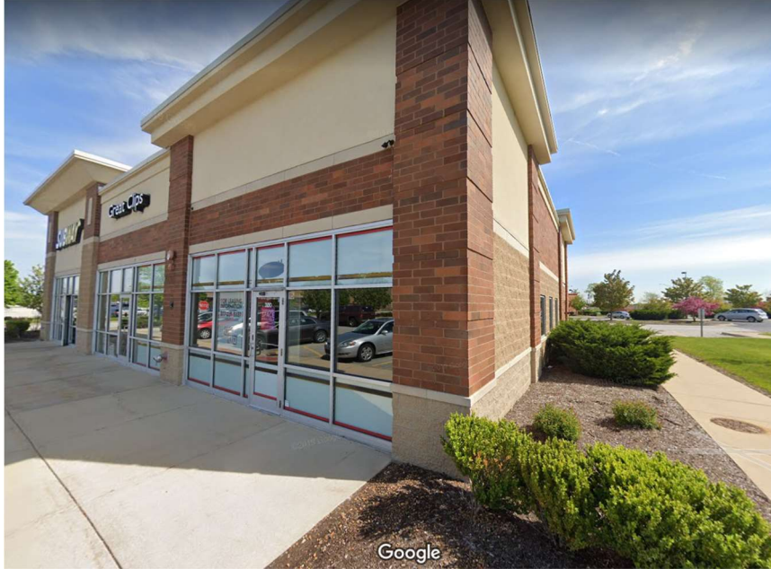
Google Streetview of 7212 191 st Street Suite 300