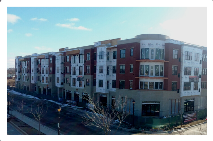
Tinley Park Train Station