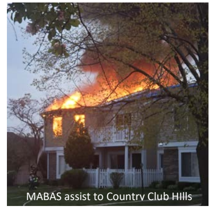
MABAS assist to Country Club Hills