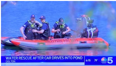
Tinley Park FD training exercises resume