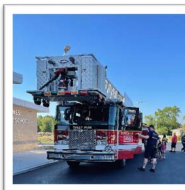
Truck 46 at Bannes Elementary school visit.