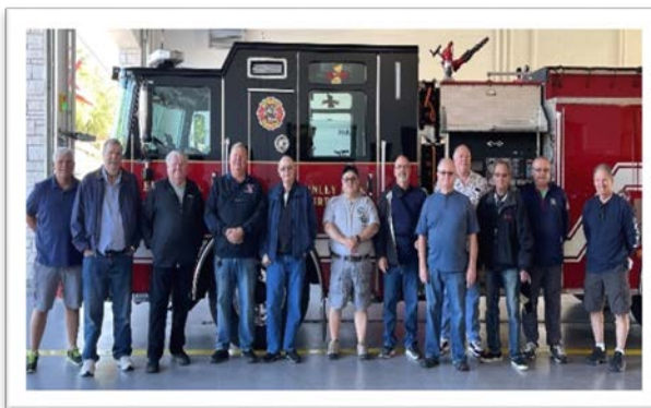
First Semi-Annual Retiree Breakfast held at Station 47.