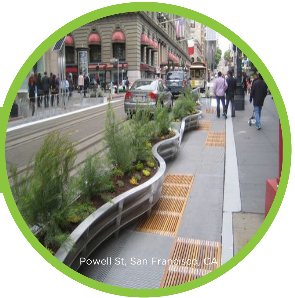
Powell St, San Francisco, CA