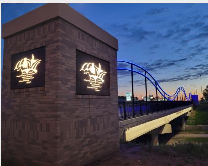
University Ave. Reconstruction