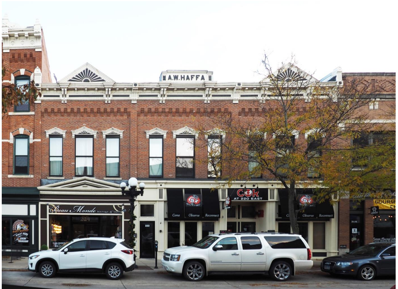
Photo 1. The A.W. Haffa Building looking across East 4 th Street to the southeast.