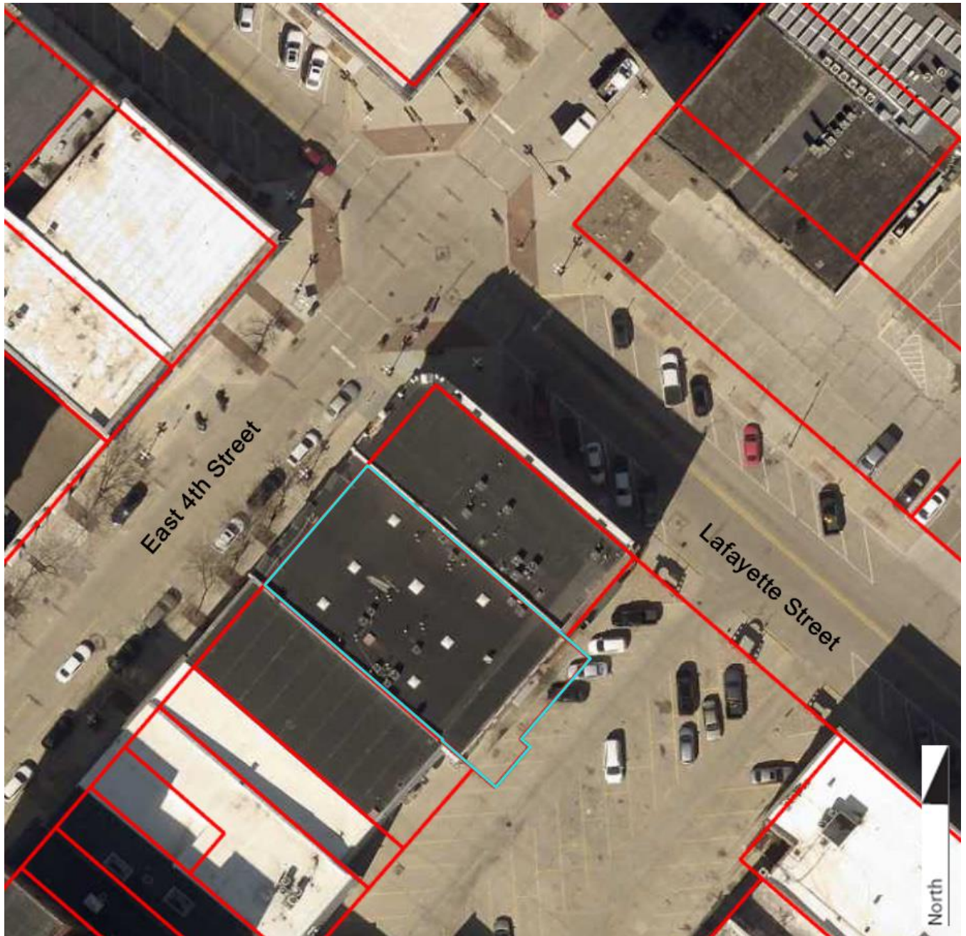
Figure 2. Site of the A.W. Haffa at 220-222-224 East 4 th Street.