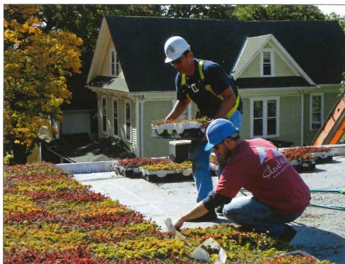
Sedum tray system is installed in Des Moines.