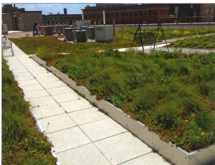
Quad Cities semi intensive rooftop has soil depths ranging from 4-8 inches.