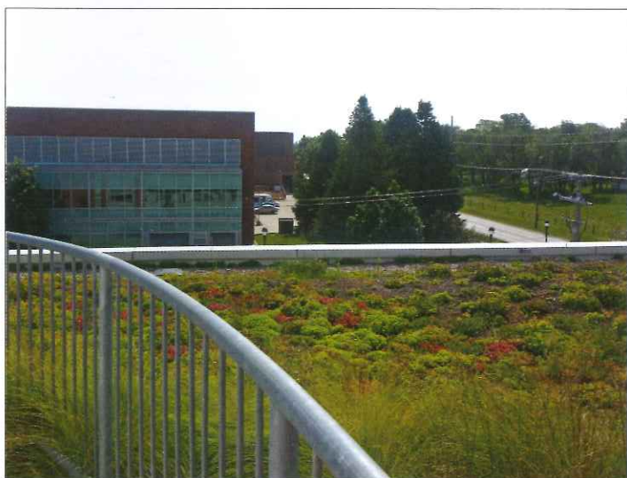
Semi intensive green roof at Central College in Pella supports more plant diversity.