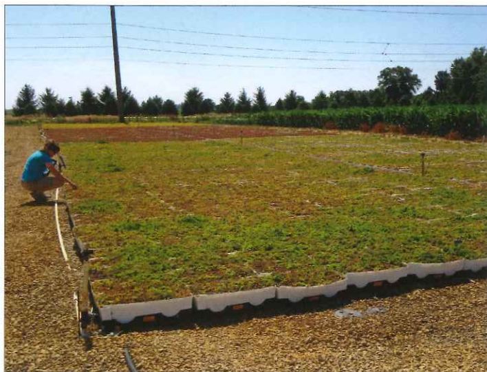
Sedum are custom grown in trays in an Iowa nursery.

There are two primary delivery and installation methods: in-situ and modular systems. In-situ or "built" up systems are constructed through a series of layers that are built-up on the roof deck using materials that arrive on-site in bulk. After placement of the components and soil media, the roof is vegetated by planting plugs, cuttings, or pre-grown mats. Modular systems or "trays" are mass produced in a nursery and individually placed on a rooftop in small 2'x4' plastic units filled with growing media. Pre-grown plants are then set on top of the waterproofing membrane and root barrier.