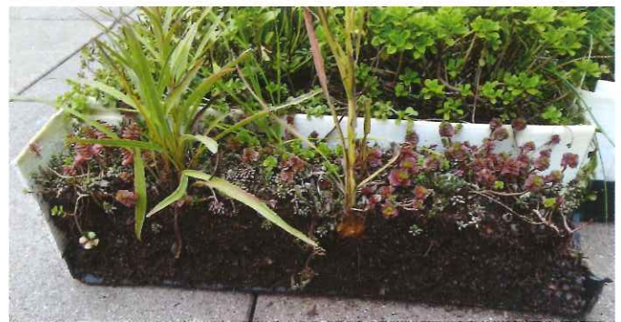
Cross section of an extensive green roof tray.