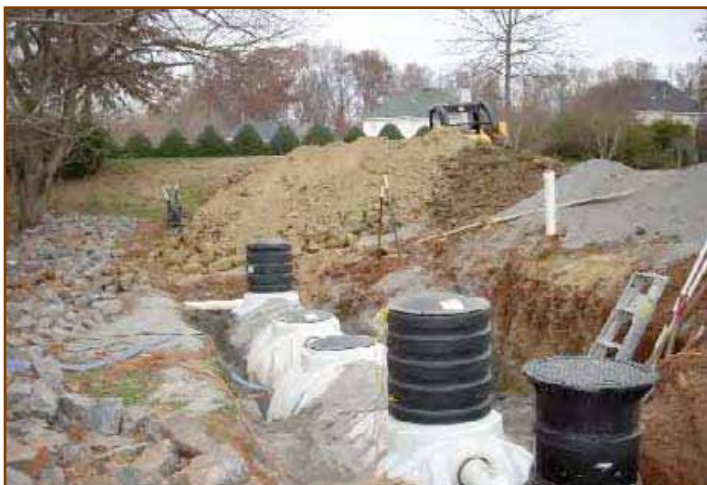
A below ground cistern installed for water harvesting storage and use.