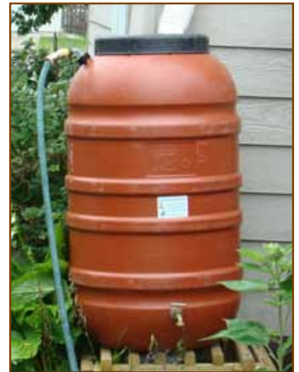
A single rain barrel is used in this yard to water vegetables and flowers.

Typically, food grade plastic rain barrels may capture up to 60 gallons of water. High density plastic barrels that are weather and ultra-violet resistant can be purchased from numerous companies and stores. Prices for rain barrels range from $75 to $300.