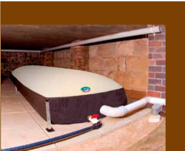
This 2000 gallon bladder captures all rooftop runoff and recycles for non-drinking water uses.

If space permits, multiple bladder tanks can be installed either end-to-end or side-by-side for maximum storage, as demonstrated in the diagram below. Bladders are typically designed to fill to a maximum height of 24 inches.