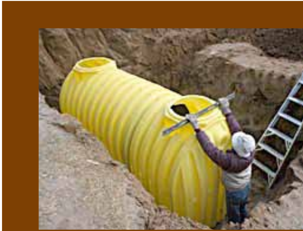
This buried cistern will be used for flushing the toilet, cold water washing, and outdoor watering. A backhoe was used to dig the hole, the tank was pushed into position, plumbed, and covered with dirt. A pump is used to pressurize the water.