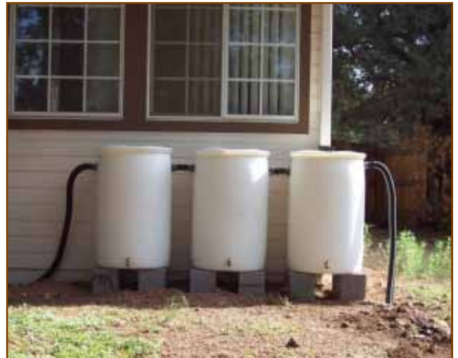
A triple set of rain barrels, connected to each other and draining to a garden or lawn area.

Winter conditions in the Midwest require cisterns be located in heated areas or placed below ground if harvested rainwater is to be used year-round. It is important to consider the weight of water when siting an above or below ground tank. Consider that water weighs just over 8 pounds per gallon, so even a small 1,500 gallon tank will weigh about 12,000 pounds. Tanks need to be placed on a level, stable surface.