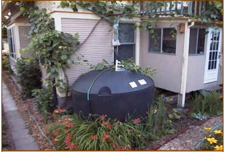
A 1500 gallon cistern fed from two gable downspouts.

Cisterns can be used as a secondary source of water for gardening in residential areas. Larger cisterns can be adapted for use to supplement non-potable (non-drinking) water systems. As stormwater reuse and water conservation becomes more widespread, the use of cisterns for non-potable water use for commercial and industrial applications will grow. Cisterns can either be above ground, below ground, stored inside a heated storage area, or anywhere outside that is deemed appropriate. Small cisterns can be as easy to install as a rain barrel. Larger systems will require a contractor.