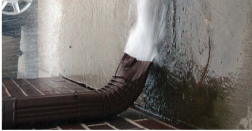
Downspouts emptying onto your driveway sends runoff to the stream and increases your hydrologic footprint.