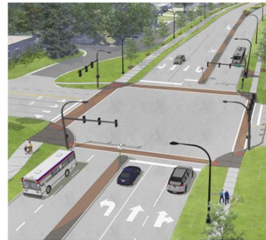
Pedestrian Crossing Enhancements