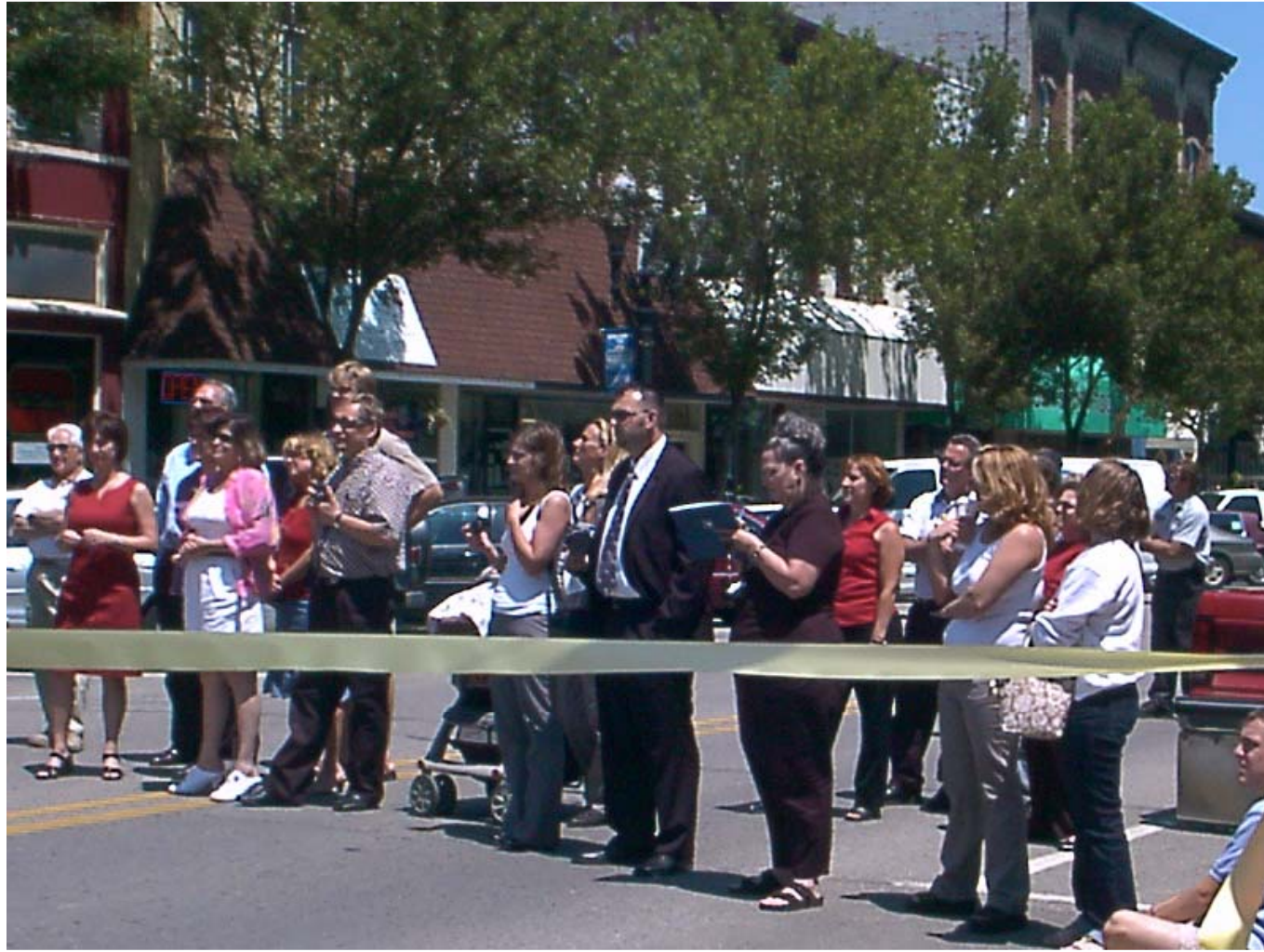
The Honorable James E. Barnes, Mayor City of Portland